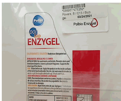
Package received - labeling COC

Laboratory Number Beta-586961 Percent modern carbon (pMC) 85.43 +/- 0.2 pMC Atmospheric adjustment factor (REF) 100.0; = pMC/1.000